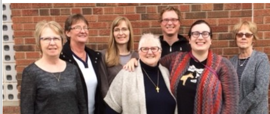
Mission in Ministry Committee 2017

A Standing Committee of the Synod, formerly known as the Canadian Mission Committee, the mandate was primarily the management of the CECF monies. Over the past few years the focus has broadened to include assisting congregations and communities to explore ecumenical relationships and learning opportunities that assist with moving out in mission and encouraging them to share their stories throughout the Synod. The Mission in Ministry Committee seeks to move forward as we follow God's calling.